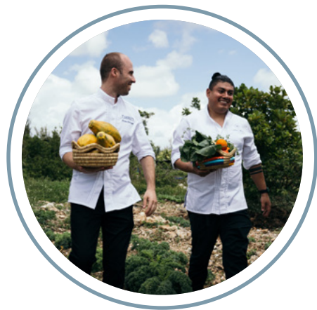
BLUE FIELD'S FARM EXPERIENCE