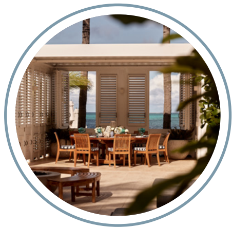
SUITE + VILLA DINING