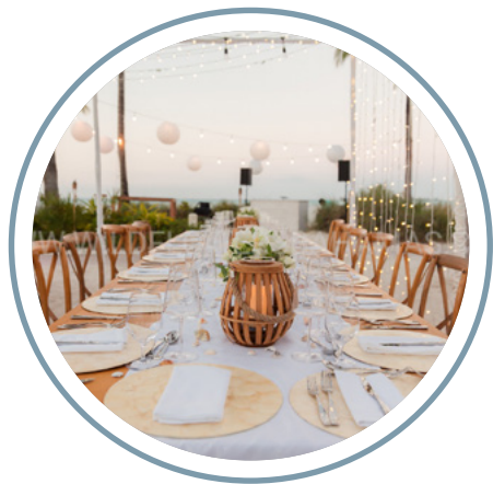
TINGUM ON THE SAND