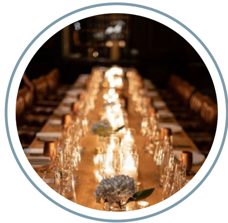
SUSTAINABLE WINE DINNER