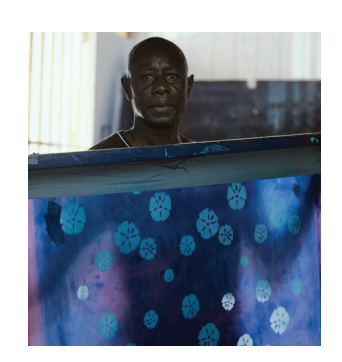
15 BAHAMA HAND PRINTS