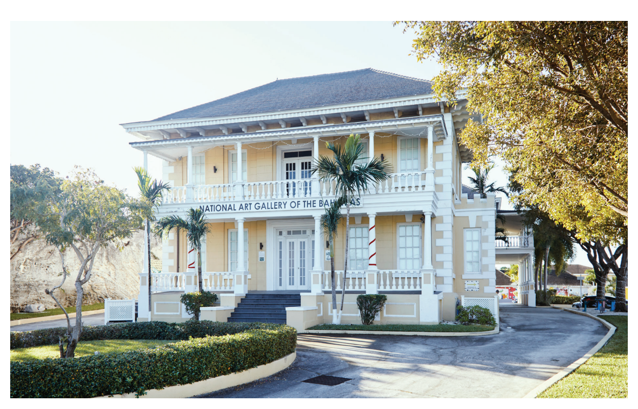
17 NATIONAL ART GALLERY OF THE BAHAMAS