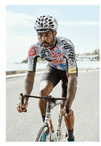
11 JOHN'S FAVORITE ESCAPE

with colonial. A good taxi driver can take you through it easily, but it's more fun to rent a bike at Cycle Unlimited. They have a cycling club, and it's easy to get one of the club members to take you for a ride around. It's also a hobby of mine.