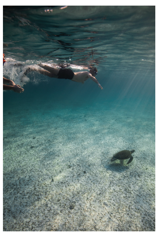
12 DIVING IN THE EXUMAS

If you like diving or snorkeling, there's also lots of relics too with shipwrecks you can explore, as well as planes that went down ages ago. And you might see one island that's covered with hundreds of iguanas and another that is surrounded by nerf sharks.