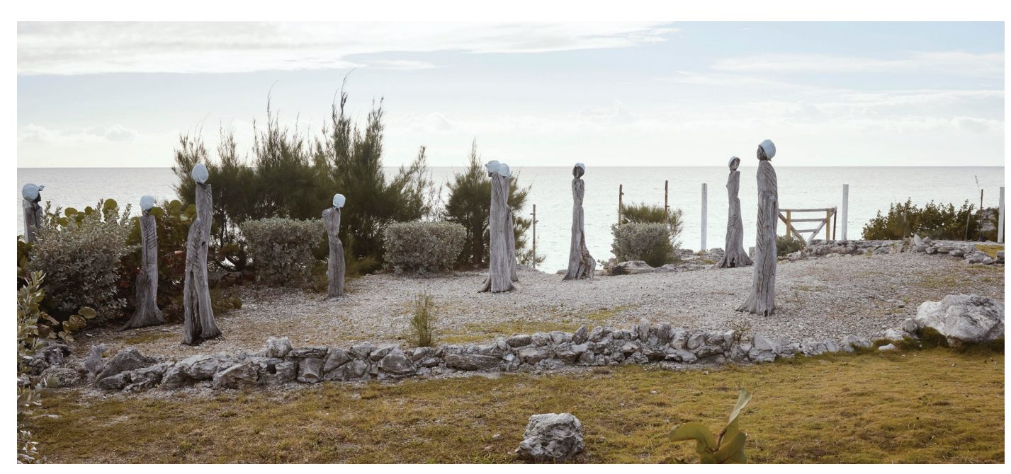
10 SACRED SPACE|GENESIS GARDEN AT CLIFTON HERITAGE NATIONAL PARK