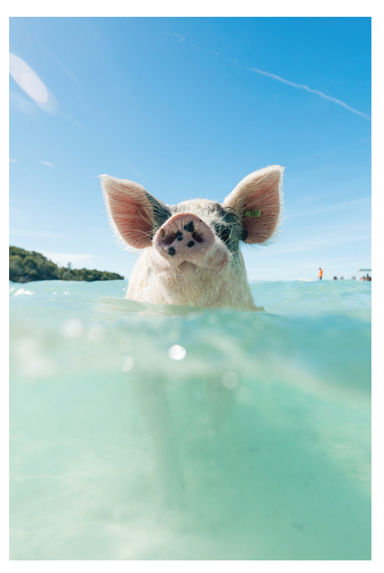
13 SWIMMING WITH THE PIGS