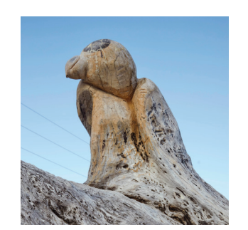
14 WOOD SCULPTURE DESIGNED BY ANTONIUS ROBERTS