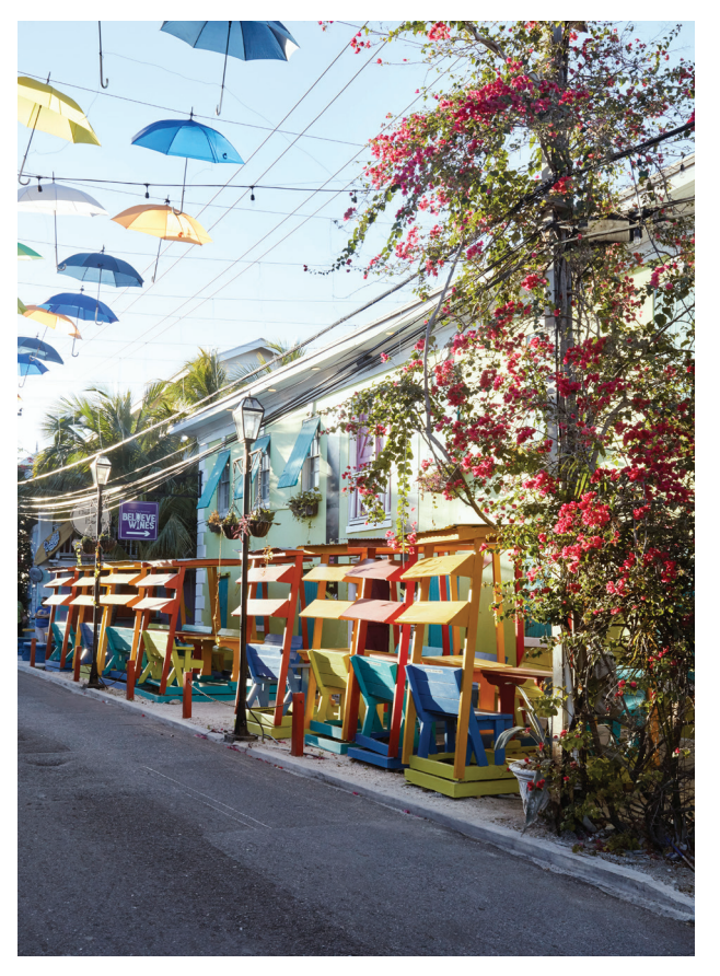
09 THE COLORFUL SIGHTS OF CHARLES TOWN IN DOWNTOWN NASSAU

Finally, there's Hillside House. A studio with a multi-purpose operation that includes a gallery, residences with artists, and even a food operation.