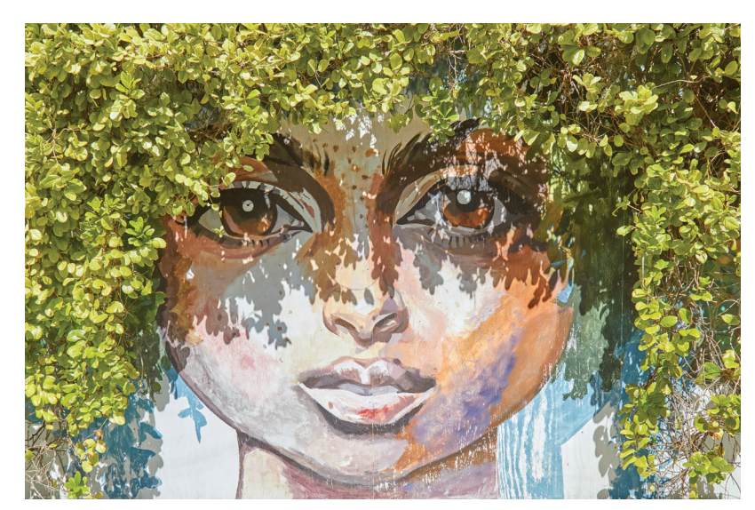
08 OPEN AIR MURAL BY ALLAN PACHINO WALLACE (D'AGUILAR ART FOUNDATION)