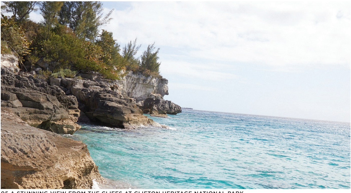
05 A STUNNING VIEW FROM THE CLIFFS AT CLIFTON HERITAGE NATIONAL PARK