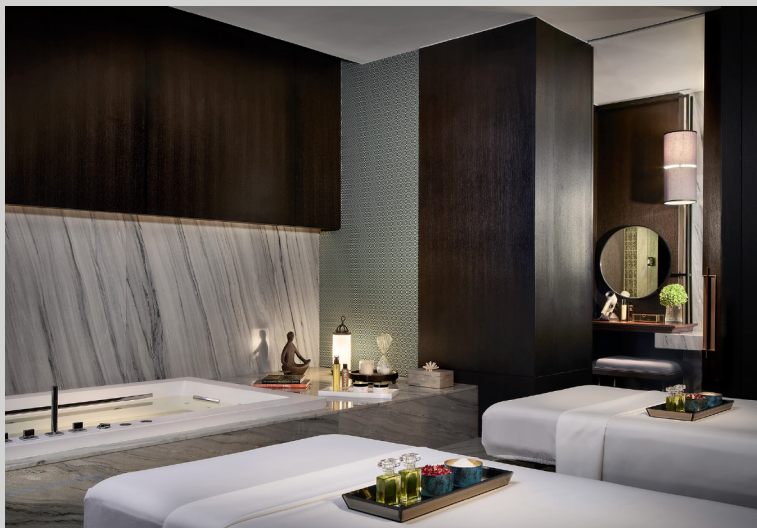
Spa Treatment Rooms