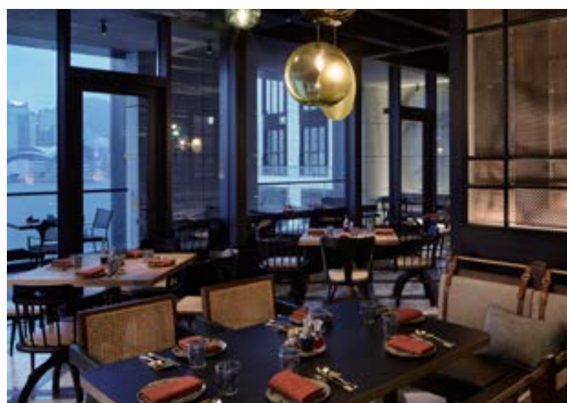
The Legacy House