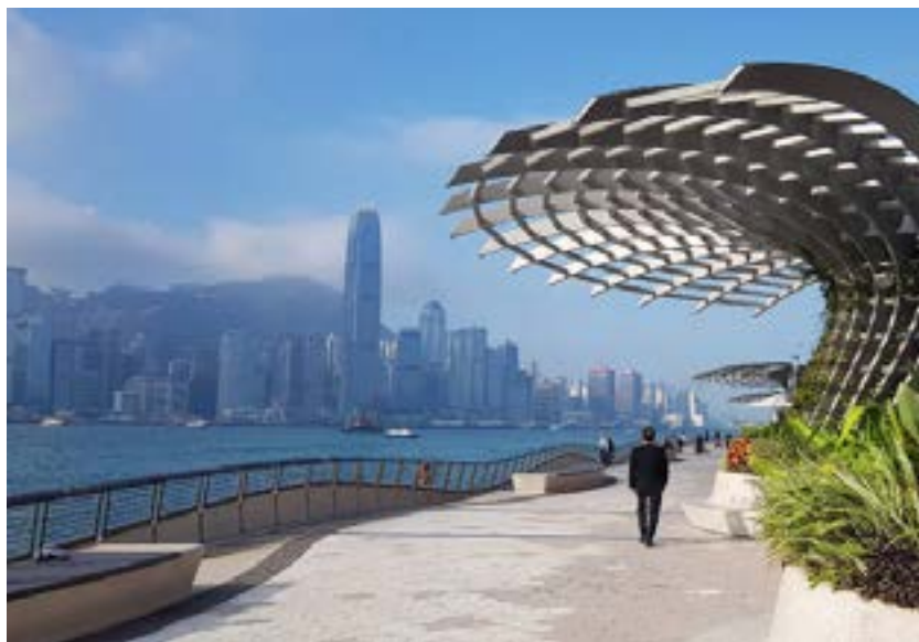
Avenue of Stars

Experience the iconic Peak Tram, a historic funicular railway since 1888. Ride in new cars with glass ceilings for unique views of Hong Kong's landscape. This cherished attraction is a must-do for families.