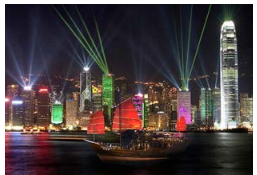
Symphony of Lights