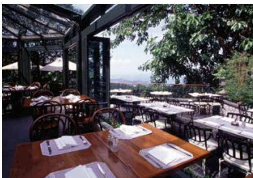
The Peak Lookout

8:00 - 8:15PM EXPERIENCE A SYMPHONY OF LIGHTS Head to the harbourfront to experience Hong Kong's iconic light show, "A Symphony of Lights." This captivating spectacle features dazzling lights and music, making it a fun and engaging experience for families.