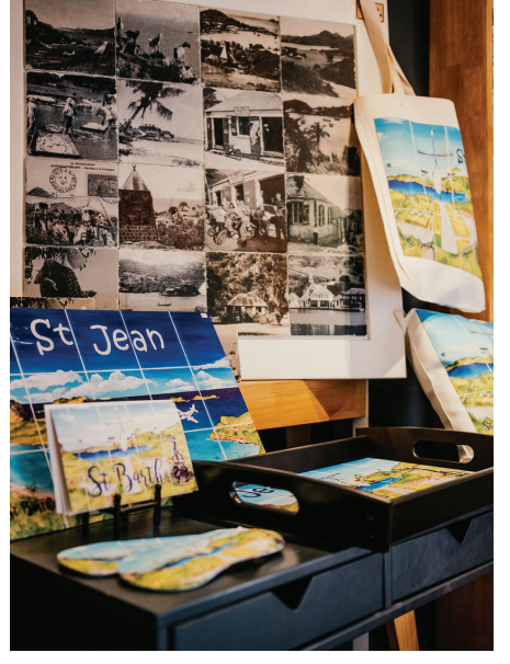
06 LES PETITS CARREAUX - BOUTIQUE