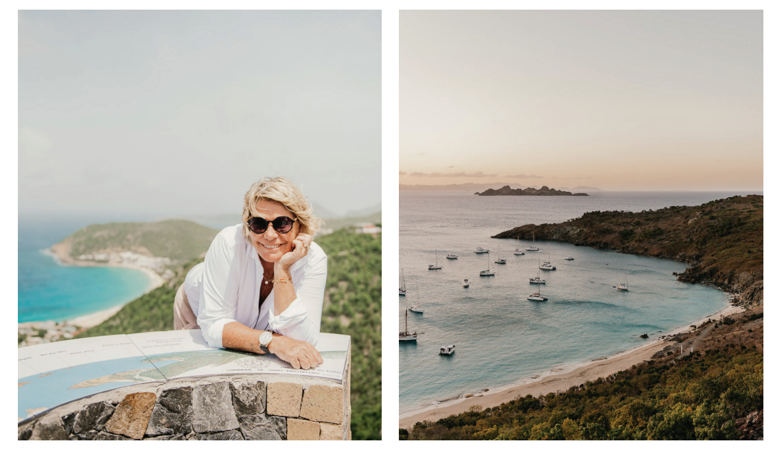
10 ANSE DE COLOMBIER

The nicest beaches on the island are protected by the government so that you can't build on them. This is one of them. The landscape is wild, and back in 1820, it was a salt mine. There are still 12 large rectangles that change from brown to orange to gold where they collected the salt from, even though that stopped in 1970. This is also a popular spot for where the turtles come to lay their eggs. There's no shade or umbrellas here, and it can get windy, so it's not my favorite for eating lunch at, but I love to come here in the morning when it's empty. It's a big beach great for swimming or walking along.