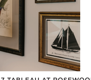
16 VIEW OF BEACH MARECHAL 17 TABLEAU AT ROSEWOOD LE GUANAHANI ST. BARTH GUEST ROOM