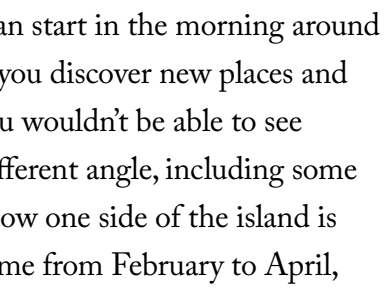
14 ANSE DE GOUVERNEUR