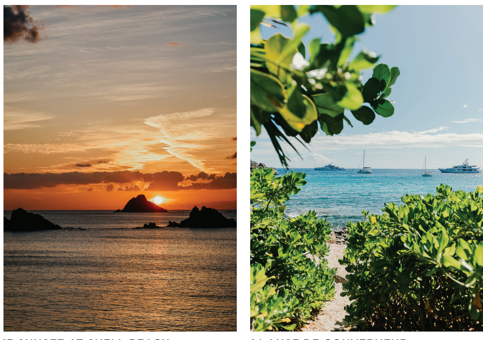
13 SUNSET AT SHELL BEACH

Shell Beach is a great place to visit on a boat. Near the water, there's a rope you can climb up and then jump into the ocean from at an elevation of 5, 8, or 10 meters. It's hard to do, but fun.