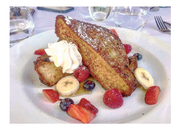
13 BRUNCH AT LE BILBOQUET