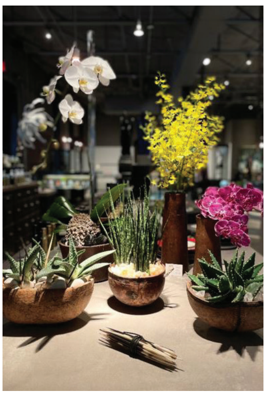
12 GRANGE HALL

Brunch at Le Bilboquet is not to be missed. The charming dining room feels right out of Europe, serving the most decadent French Toast and grass-fed Texas beef.