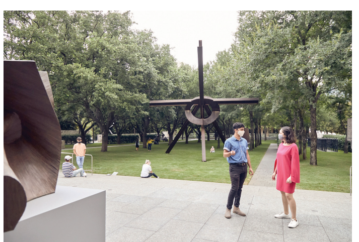
20 NASHER SCULPTURE CENTER.

Grab a slice of cheesecake from Val's (they even have cheesecake cupcakes), head back to The Mansion and savor it the comfort of your fluffy Mansion robe.