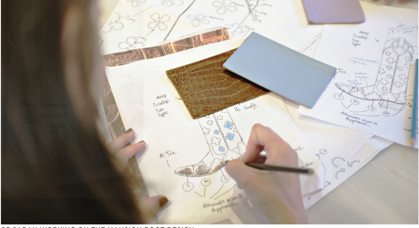
05 SARAH WORKING ON THE MANSION BOOT DESIGN