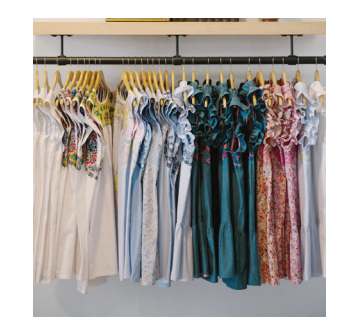
15 HAND-STICHED AND HAND-EMBROIDERED DRESSES AT MI GOLONDRINA