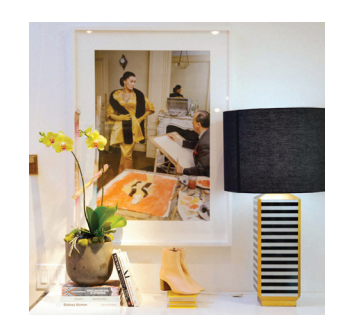
14 DETAILS AT CANARY