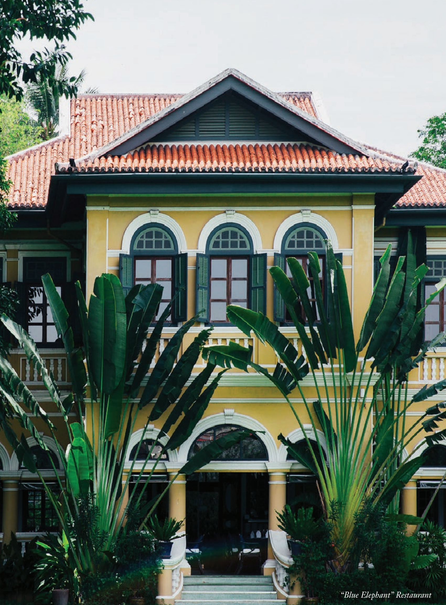
"Blue Elephant" Restaurant